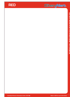
1 per Page Labels

Available in paper or chemical resistant vinyl in Red, amber and green