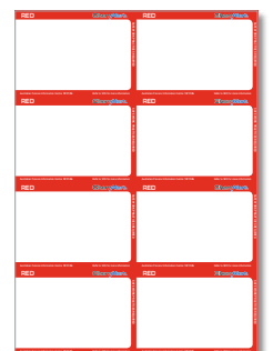
8 per Page Labels